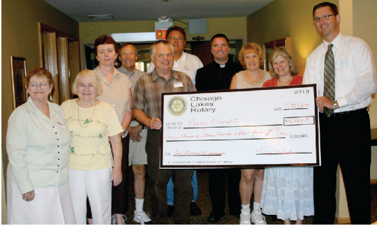
Chisago Lakes Rotary Club-Baby Blanket Donation 2010