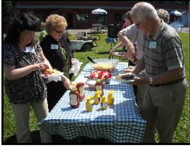
Picnic Lunch at Wild Mountain