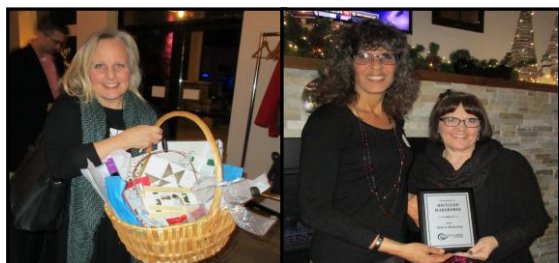
Prizes & Awards!

We want to thank each and every one of you who joined us to celebrate at WineHaven Winery for the Chisago Lakes Chamber Annual Meeting & Holiday Gala .