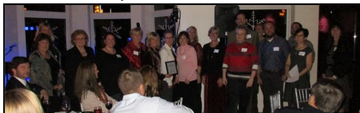
2016 Community Ambassador - ABC Team