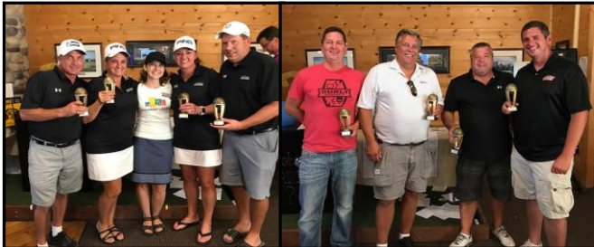
Hanson & Associates- American Family Mixed Division