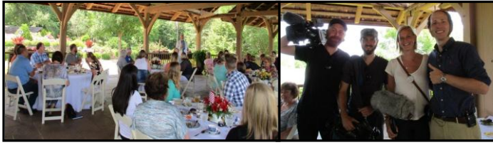
Panola Valley Gardens