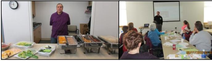
Chiko's Cocina Mexicana