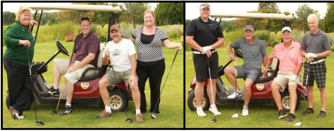
Chisago Lakes Rotary Mixed Division