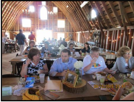
Bloom Lake Barn

August Chamber luncheon was held at Bloom Lake Barn and catered by Deutschland Meats . Coffee was provided by Northwoods Roasterie . Thank you to Grand Casino Hinckley and Recycled Wardrobes for prize drawings.