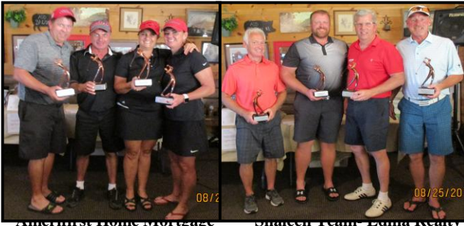
Amerifirst Home Mortgage American Family Insurance Mixed Division