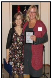
WILD MOUNTAIN 'Best in Marketing'