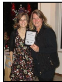
PICKET FENCE GALS 'Best in Customer Service'

Picket Fence Gals a wonderful business that knows how to draw the customers in and keep them coming back for more. Local residents and shoppers from across state lines look forward to those 5 days a month when they can shop for that perfect vintage, upcycled, or whimsical item. These gals know how to help customers seek fun finds, check out with ease and even load up large purchases. Customers leave this business feeling happy, helped and ready to return for more fun next month!