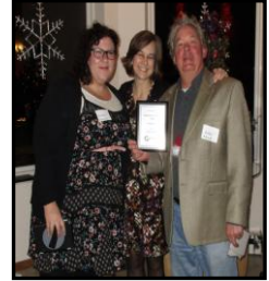
FRANCONIA SCULPTURE PARK 'Vision Award'

The Vision Award is given to a business or organization that takes a look at the community, spots a need and finds a way to go forward and fill that need by expanding what they do or who they serve. This organization already fills an amazing need in Chisago Lakes by sharing art through education & experience with residents and thousands of visitors yearly. But, they wanted to share art with more people and offer more hands on art experiences so they have been working towards bringing that to a reality.