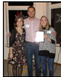
BLOOM LAKE BARN 'Best Business Renovation'

Picket Fence Gals a wonderful business that knows how to draw the customers in and keep them coming back for more. Local residents and shoppers from across state lines look forward to those 5 days a month when they can shop for that perfect vintage, upcycled, or whimsical item. These gals know how to help customers seek fun finds, check out with ease and even load up large purchases. Customers leave this business feeling happy, helped and ready to return for more fun next month!