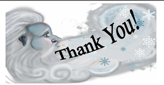
THANK YOU for a wonderful Celebrate Chisago Lakes~Winter Blast!

This year's winter event brought new activities which were a big hit with all ages!