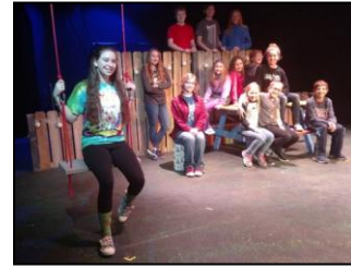
The youth cast of Peter Pan

Peter Pan will run March 9 th -18 th at 7:30pm . Opening night will feature Festival Theatre's AfterGlow party, complete with pizza provided by Papa Murphy's.